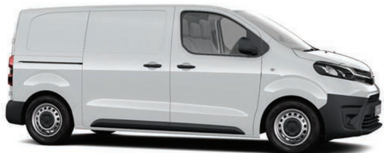
Icy White (EPR)