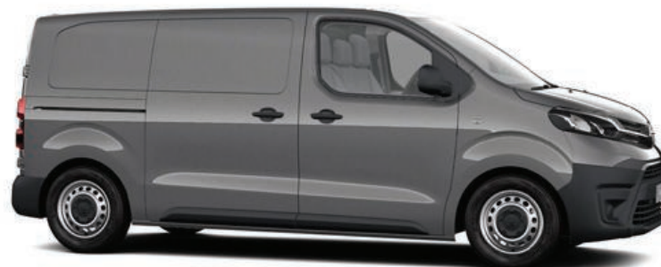
Dark Grey (EVL)