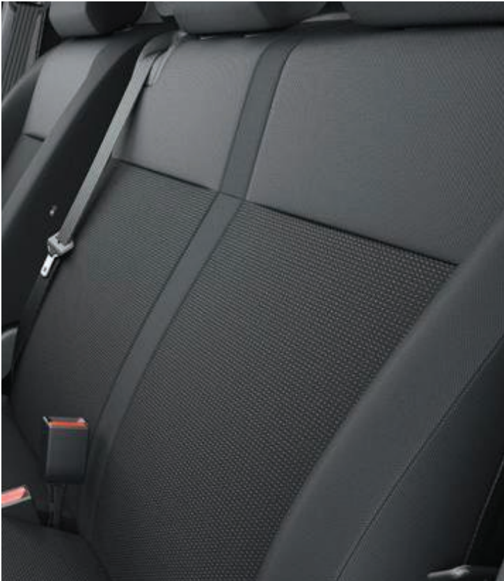
Dark grey fabric (43FT)

Available in dark grey fabric with a unified black instrument panel that delivers a fresh image.